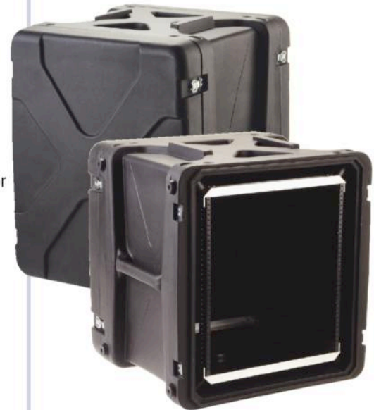
Roto Shock Racks - 20" Deep