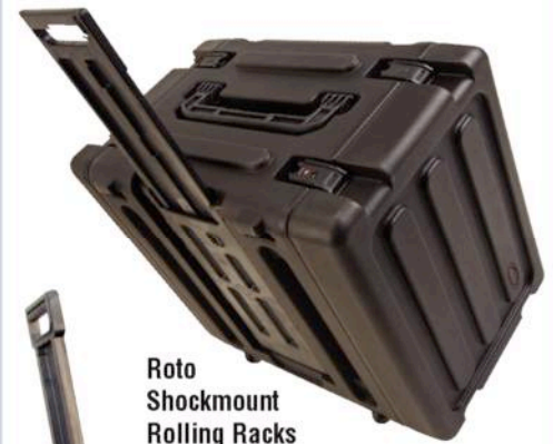
Roto Shockmount Rolling Racks