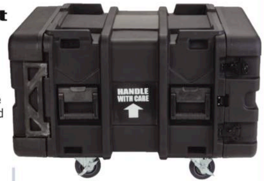
Roto Shock Racks - 24" Deep