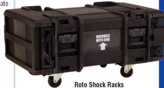
Roto Shock Racks 28" and 30" Deep