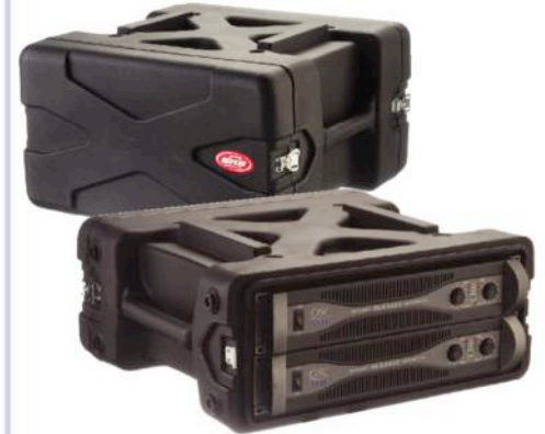
Ultimate Strength Roto Racks