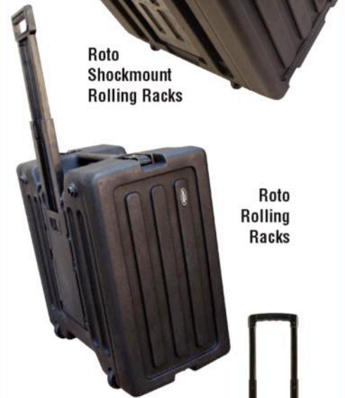
Roto Rolling Racks